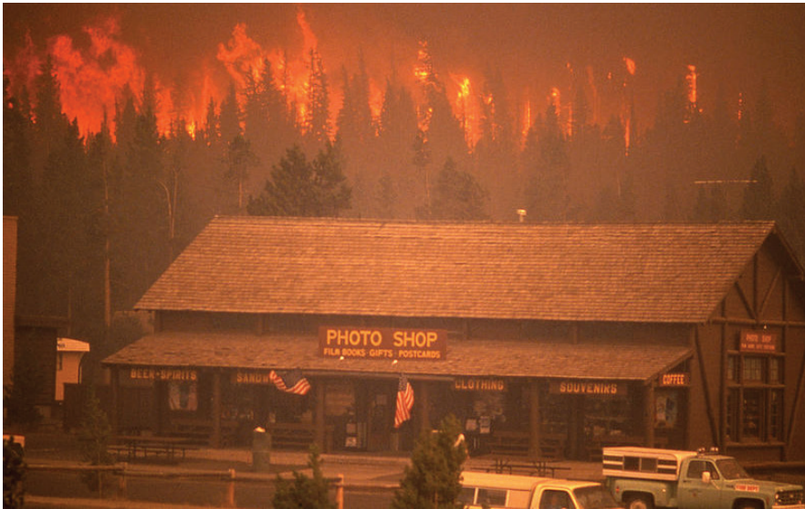
Fire approaches a gift shop in Yellowstone National Park on September 7, 1988.

Wildfires are usually driven by strong surface winds. Adding to the phenomena, a wildfire also creates its own weather atmosphere as it burns. The hot flames and gases rise rapidly from the fire and displace the relatively cooler surrounding air. This displacement leads to surface wind patterns that can blow at speeds of 70 miles per hour—near-hurricane force.