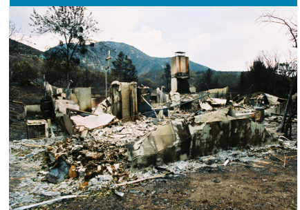
Little is left of this home near San Bernardino, CA following wildland fire in October 2003.